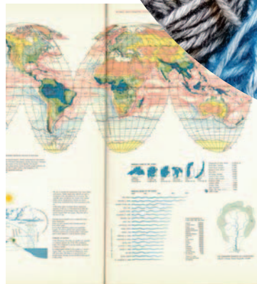
Herbert Bayer’s “World Geo-Graphic Atlas: A Composite of Man’s Environment”

→ Published in 1953, Herbert Bayer’s World Geo-Graphic Atlas revolutionized the form and set new standards for data visualization and graphic design. This summer the Aspen Institute’s Resnick Center for Herbert Bayer Studies is celebrating the landmark work with the exhibition “Concept of a Visualist: Herbert Bayer’s World Geo-Graphic Atlas,” drawing on original artworks to examine how Bayer realized this fascinating work. A companion exhibition in the Doerr-Hosier Center includes multimedia displays and a replica of Bayer’s 1943 walk-in “Outside-In Globe” sculpture. Free, 12 to 5 p.m., Tuesday through Sunday; select Wednesdays, 12 to 7 p.m.; thebayercenter.org